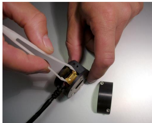
Figure 2. PPLN clip installation