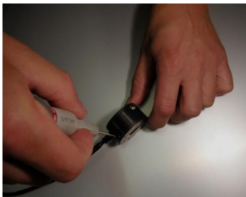
Figure 1. Oven top removal

Covesion's PPLN oven is designed for optimum operation of PPLN crystals at elevated temperatures, and also offers a convenient and accurate method of mounting and aligning optical crystals within an optical train.