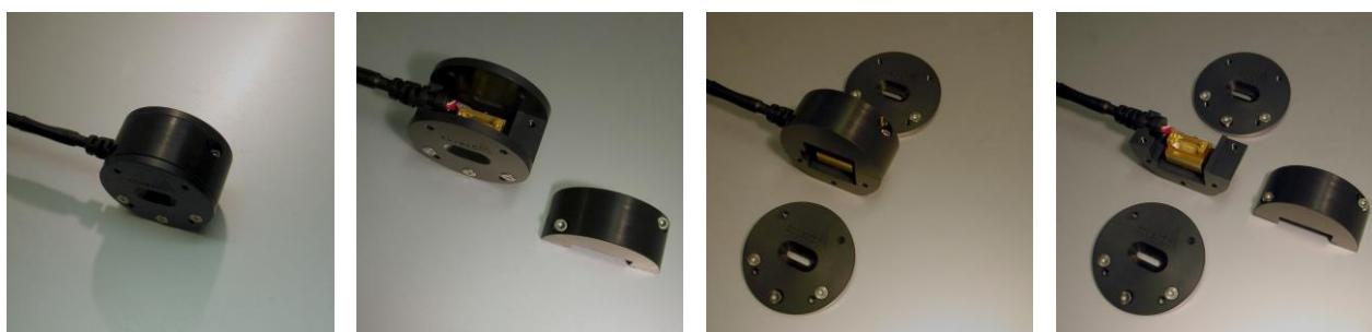
Figure 4. Oven configurations

The PPLN oven can be operated in a number of different configurations, which through the removal of insulation allows increased access to the PPLN crystal, however a decrease in oven efficiency and stability will occur. The oven can be operated without the oven top in place, this can be achieved by following the removal procedure outlined above. If greater access to the PPLN crystals optical facets is required, then the end plates of the oven can be removed. The end plate is removed by using a 1.5mm hex driver to take out the three retaining bolts. When replacing the end plates, a similar degree of care must be taken as is associated with the removal and replacement of the oven top, excessive force applied to the retaining bolts may result in damage to the oven.