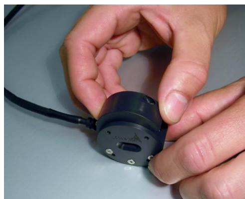
Figure 3. Oven top replacement

When replacing the oven top, check that the recess for the cable is on the correct side. It must also be ensured that the spring pins, which push the clip onto the heater, locate properly and will not be damaged as the top is pushed on. As the oven top is relocated gently push down towards the heater and tighten the retaining bolts (shown in figure 3). Do not use excessive force to tighten the retaining bolts , otherwise thread damage may occur making it impossible to fasten the oven top.